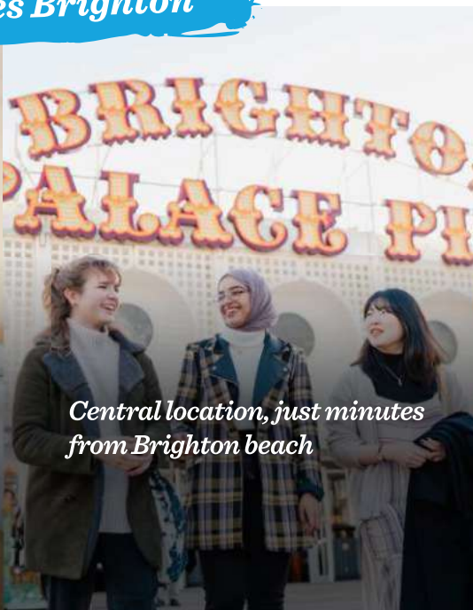
Central location, just minutes from Brighton beach