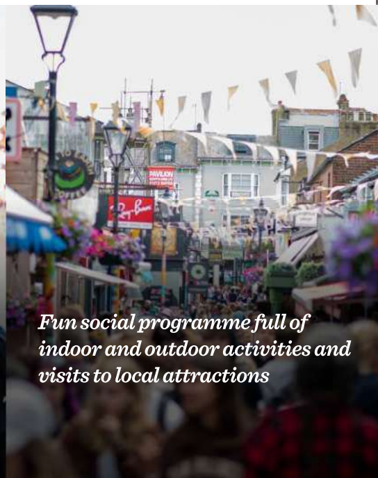
Fun social programme full of indoor and outdoor activities and visits to local attractions