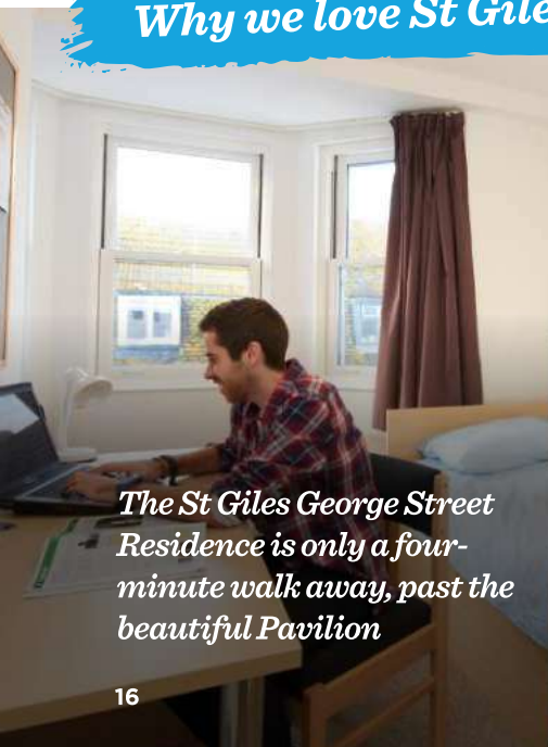
The St Giles George Street Residence is only a four-minute walk away, past the beautiful Pavilion