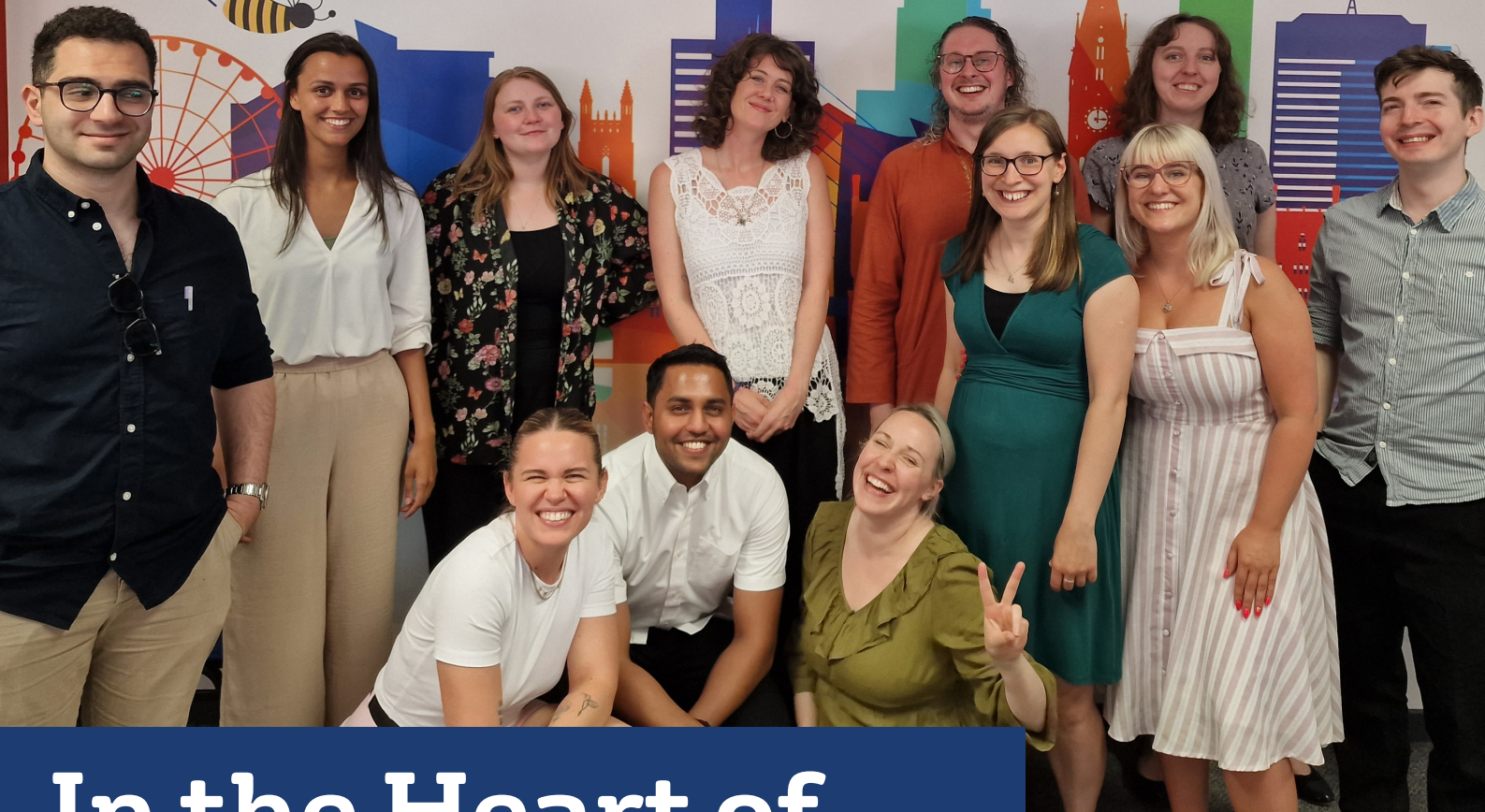
IH Manchester staff