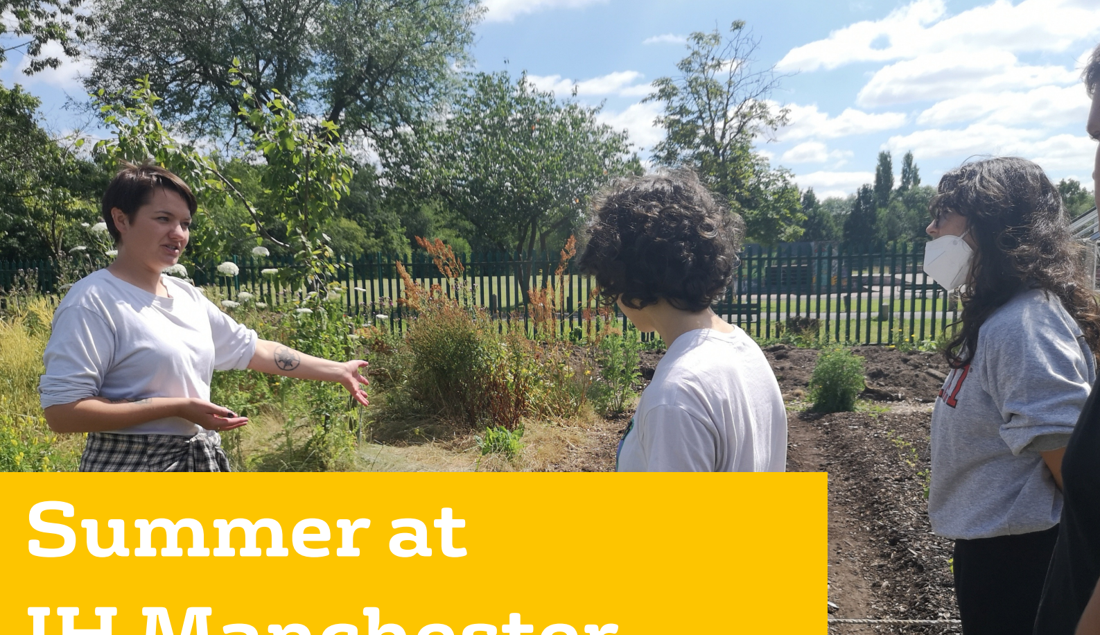
IH Manchester students