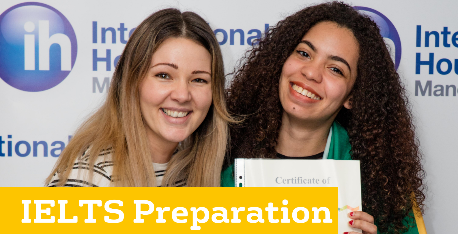
IH Manchester staff and student