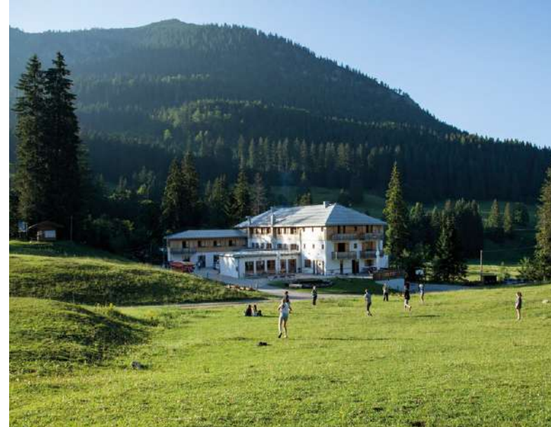
THE CAMP, A BEAUTIFULLY RESTORED HOTEL ON LAKE SPITZINGSEE