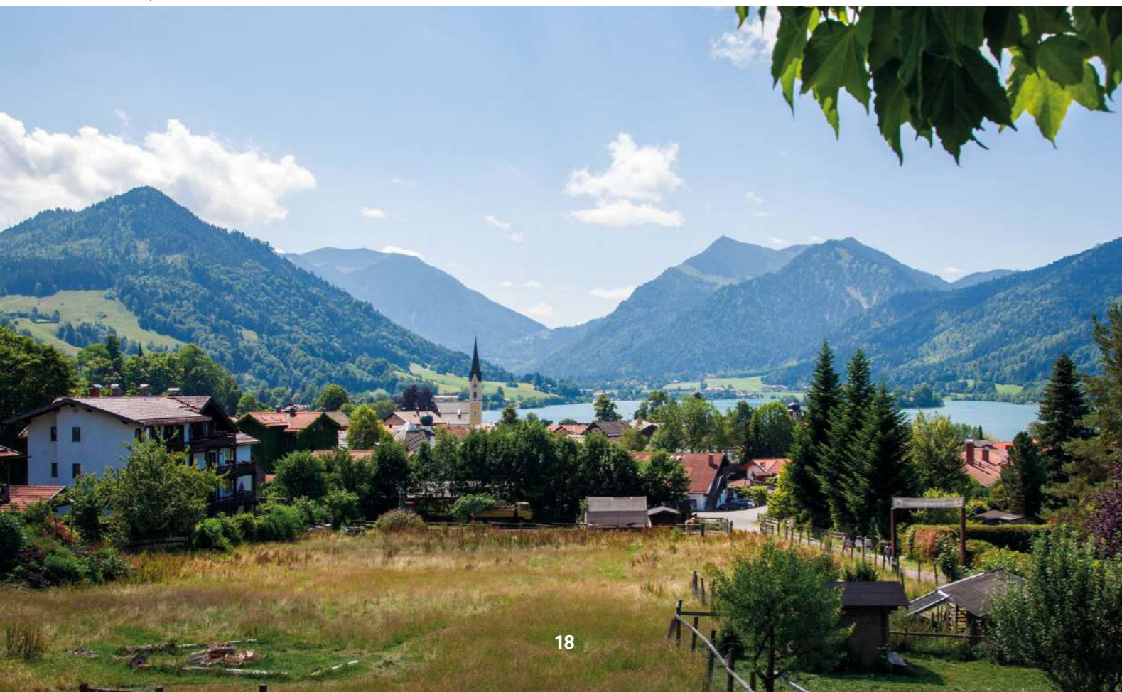
JOSEFSTAL, LOCATION OF THE CAMP