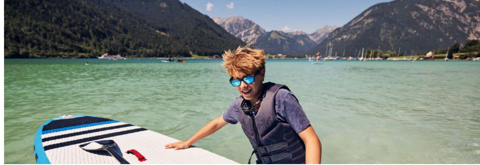
SUMMER CAMP MUNICH ADVENTURE