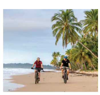
Climate and environment are perfect for outdoor activities