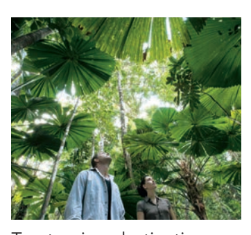
Top tourism destination, over 2.8 million visitors each year