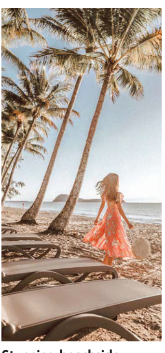
Stunning beachside community surrounded by pristine environment