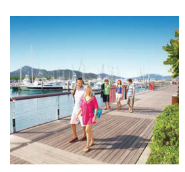
Superb tropical climate and relaxed lifestyle